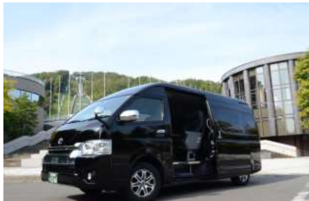
** The limousine changes according to the No. of clients, Alphard or Premium Haice.

Accommodation @ KEIO PLAZA HOTEL SAPPORO, which is located in the center of Sapporo.