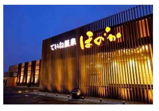
After the hot spring, get back to hotel.