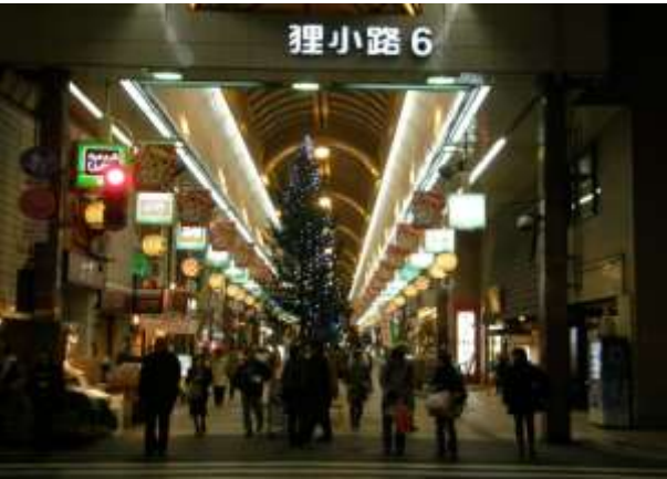
Back to hotel in the evening.